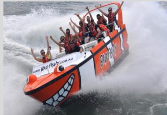
Subject to meeting minimum numbers