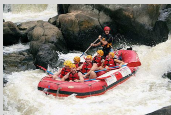
Subject to meeting minimum numbers