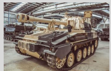
Subject to meeting minimum numbers