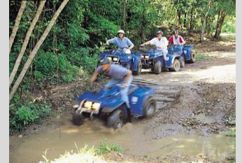
Subject to meeting minimum numbers