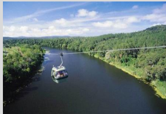
Subject to meeting minimum numbers