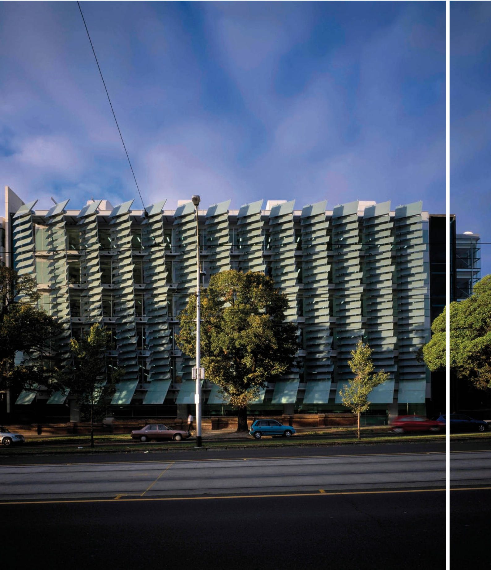
The David Pennington Bio 21 Institute Building, University of Melbourne, designed by DesignInc Melbourne