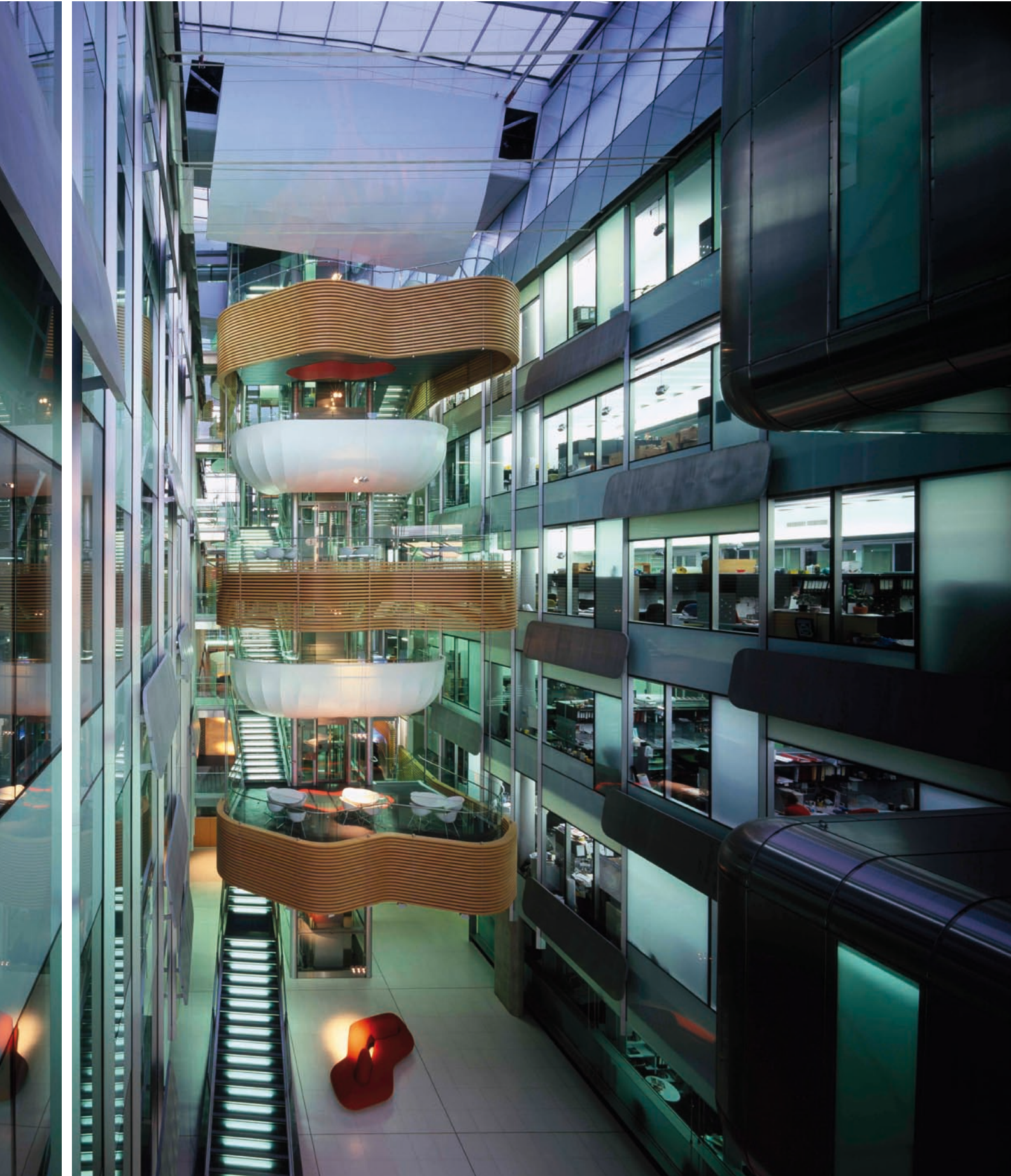
The David Pennington Bio 21 Institute Building, University of Melbourne, designed by DesignInc Melbourne